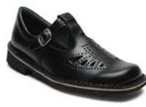
Reception to Year 12