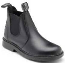
Reception to Year 5