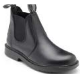
Reception to Year 5