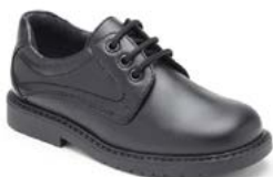
Reception to Year 12