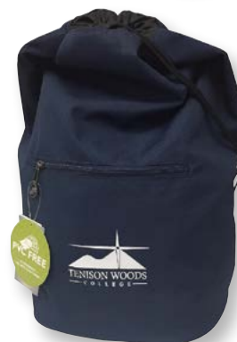
Optional Sports Bag