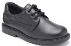
Reception to Year 12