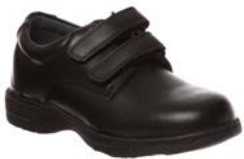
Reception to Year 5