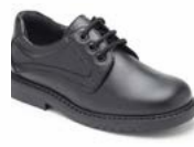
Reception to Year 12