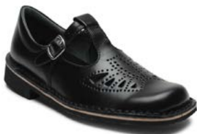
Reception to Year 12