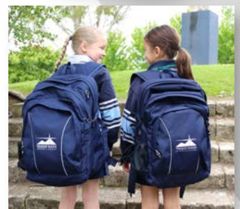
College Backpack 2 Sizes Available