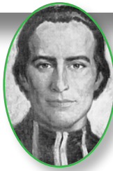
St Marcellin Champagnat