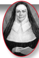
Venerable Catherine McAuley