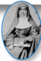
St Mary MacKillop