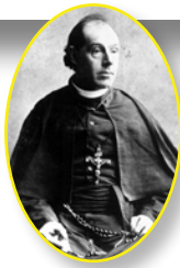
Fr Julian Tenison Woods