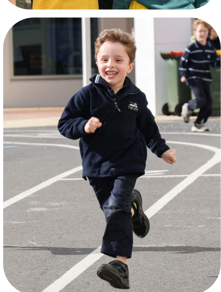
See our Facebook page for more photos