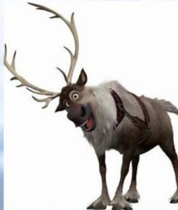
Sven ISLA BIGGINS